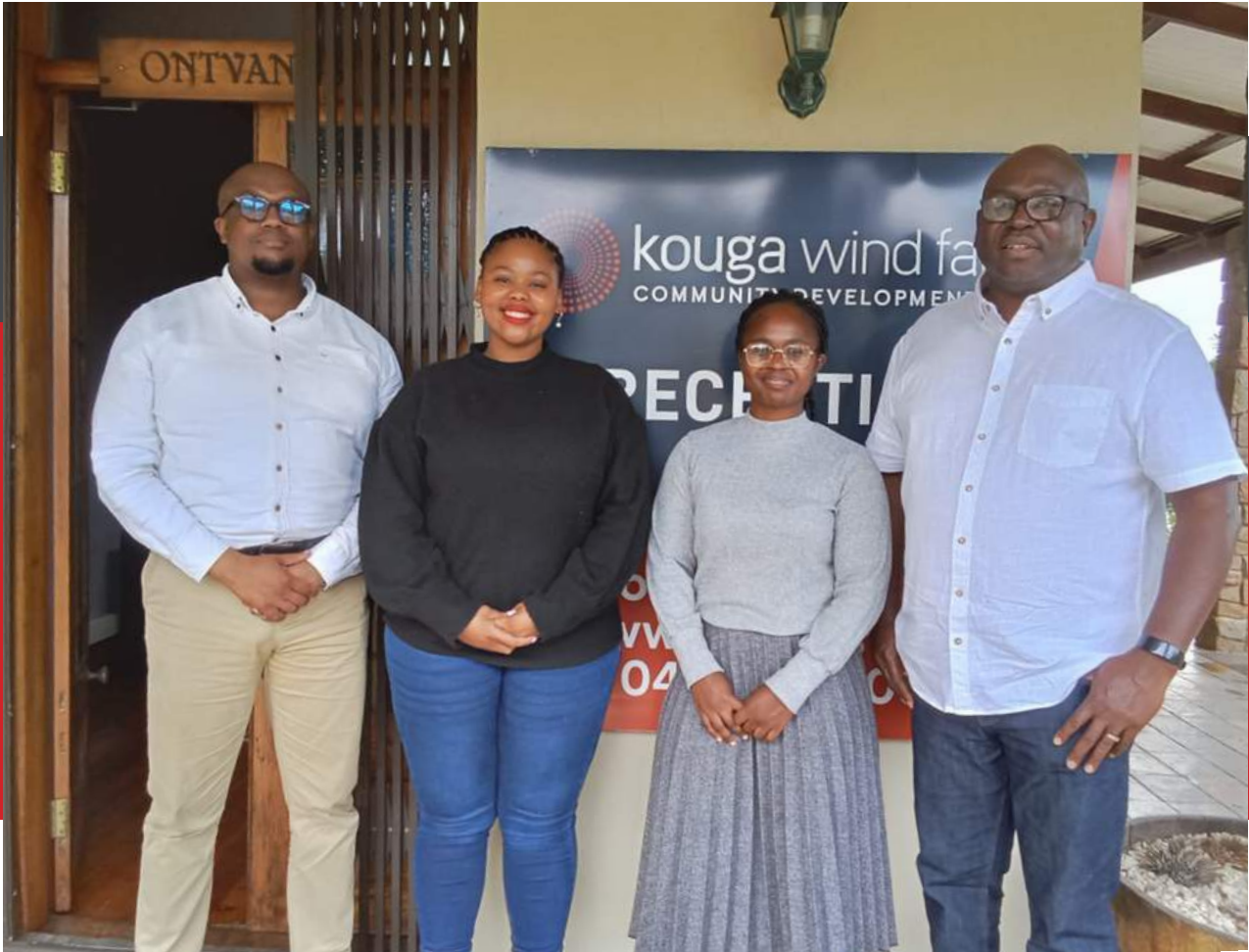
KWFCDT TEAM 2024